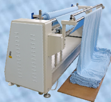
後視圖 Rear View

A2016-1 放布板層架(四層) Fabric Support (4-layer)