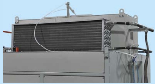
蒸汽熱交換器(帶冷風門) Steam Heat Exchanger (with Cold Air Damper)