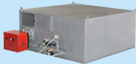
瓦斯熱交換器(原裝意大利燃燒機) Gas Heat Exchanger (Burner imported from Italy)