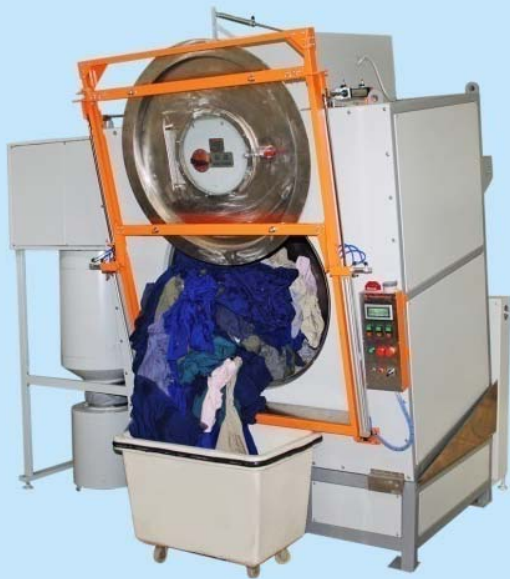
機身傾斜倒料 Machine body tilting for garment unloading