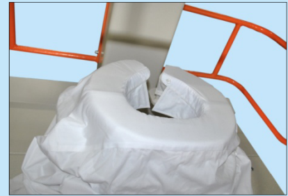
操作示意圖 In working