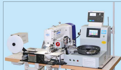
配合選購件NS-100-2操作 Used in combination with NS-100-2