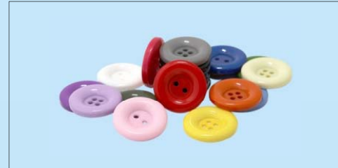
四孔和二孔鈕扣 4-hole and 2-hole Button