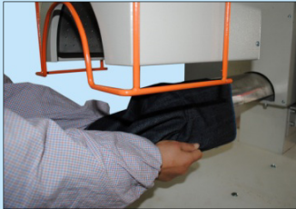
工作中 In working