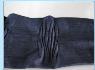
效果相 Finished Effect