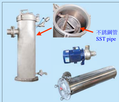
O-I-52-06 外置式間接加溫系統 External indirect heating system