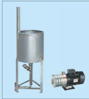
O-I-21-02-100 自動入藥水系統-100L Automatic Chemical Feeding System-100L