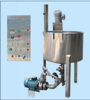
O-I-21-04-200 鹽水配量缸連輸送系統-200L Salt dosing tank with feeding system-200L