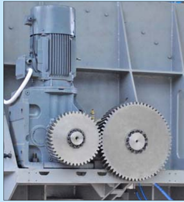
齒輪驅動系統 Gear driving system of