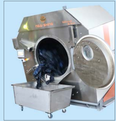
可傾斜卸料系統 Tilting unloading system