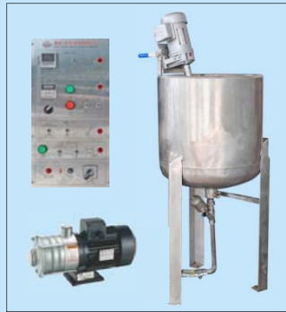
O-I-21-03-100 藥水配量缸-100L Chemical dosing tank-100L