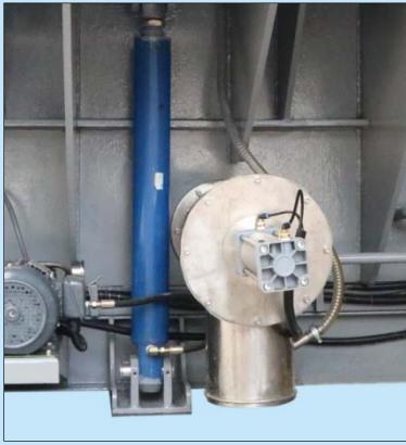
單排水系統 Single water draining system