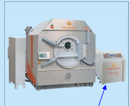
VaporTec 200 納米霧化系統