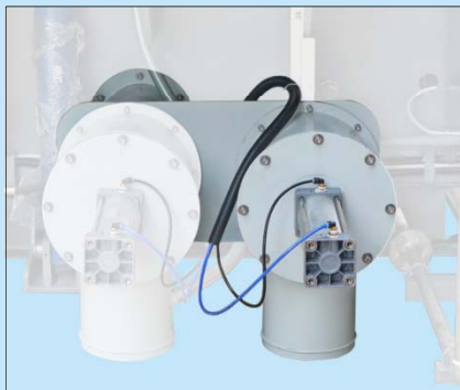
O-I-82-01另增氣動排水系統 - Ø8" Optional pneumatic water draining system - Ø8"