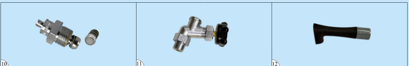
C33-3702-8 蒸汽開關 Steam Valve