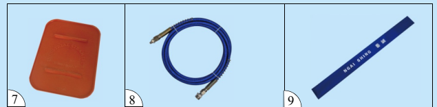
C33-00082 燙鬥墊 iron pad