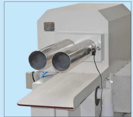
雙褲管安裝效果圖 Installation effect of double legger