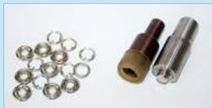
五爪鈕 Five claw button