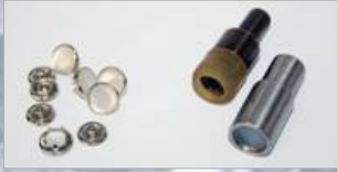
珍珠鈕 Pearl Button