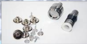
工字扣 Jeans Button