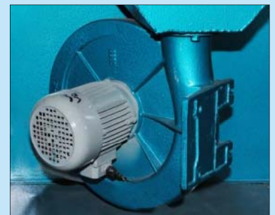
離心式中壓風機 Centrifugal medium pressure fan