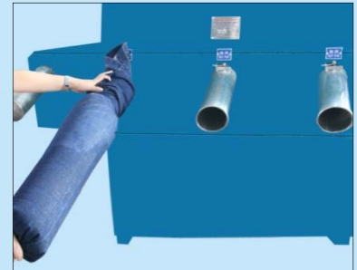
工作中 In operation