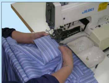
釘鈕過程中輔助夾緊袖片 During Button stitching, it helps to clamp shirt sleeve pieces