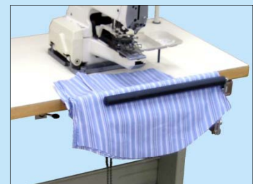
氣動夾片 Pneumatic pieces clamping