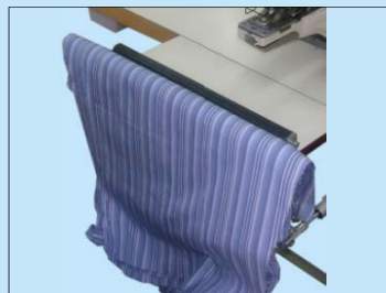
氣動夾片 Pneumatic pieces clamping