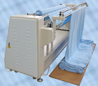
後視圖 Rear View