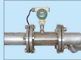
O-I-70-02/ O-I-70-03 入水流量計系統 (選購件) Water inlet flow meter system (Option)