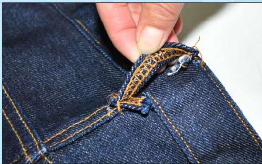
切前 Before Cutting