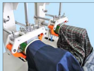
雙側同時操作 Both sides creasing simultaneously