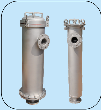
外置間接加熱及過濾系統 External indirect heating and filtering system