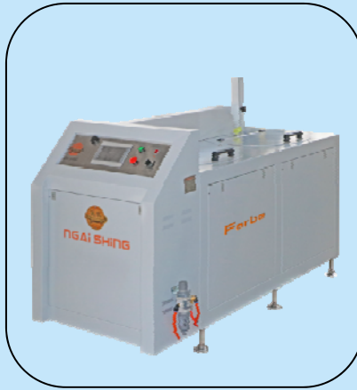
Farbe染色系統(100L x1Pc, 200L x1Pc) Farbe dyeing system (100L x1Pc, 200L x1Pc)