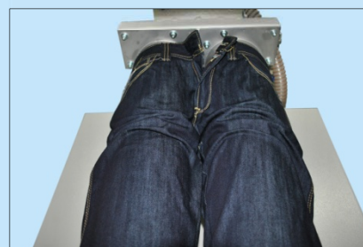
操作中 In operation