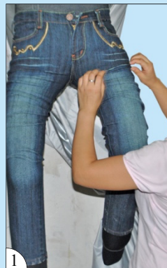
1 立體摺皺操作 3-D trousers crinkling operation

Sponge Trousers Dummy： large sized C17-RP-010-3-1-2 middle sized C17-RP-010-3-2-1 small sized C17-RP-010-3-3-1