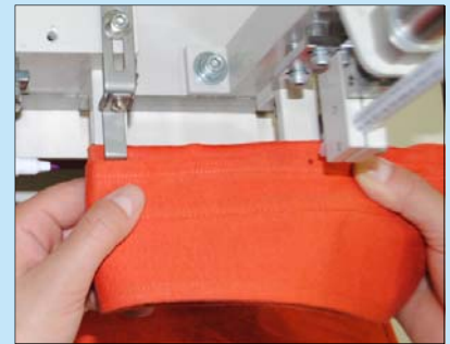
筆印點領，快速準確 Fast and accurate collar marking