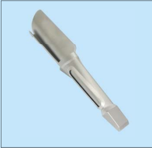
F537摺袋貼蝴蝶 Plait Folder