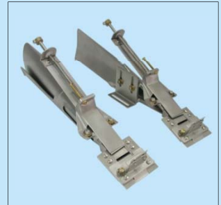
F539四方摺貼蝴蝶 Rectangular Sleeve Placket Folder