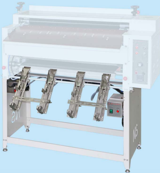
O-C-08-02 自動收料系統 Automatic Collecting System