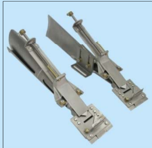
F538三尖側貼蝴蝶 Triangular Sleeve Placket Folder