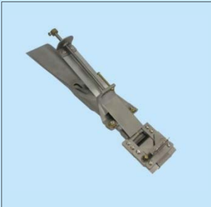
F540三尖側貼蝴蝶 Triangular Sleeve Placket Folder