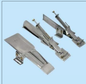
F541三尖側貼對條蝴蝶 Triangular Sleeve Placket Folder