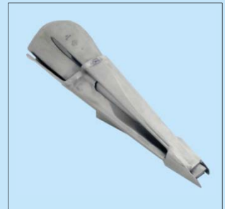
F543摺袋貼蝴蝶 Plait Folder