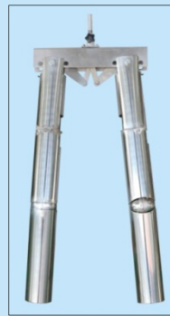
TH-301-A 立體褲架-Ø4" 3-D Trousers Hanger -Ø4"