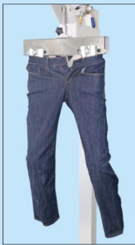
操作效果 Operation result