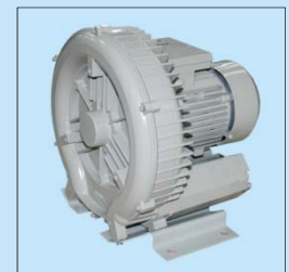
抽風泵，適用於NS-525-B和NS-526-B Vacuum pump, for NS-525-B & NS-526-B