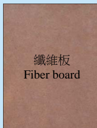
纖維板 Fiber board