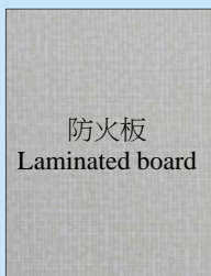
防火板 Laminated board