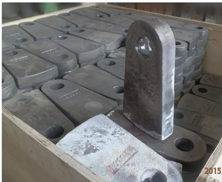
Bimetal hammers-inspected piece by piece