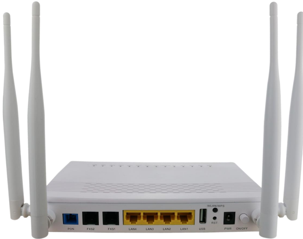
Picture 2-1 G8007U-SRD-DGB back panel picture