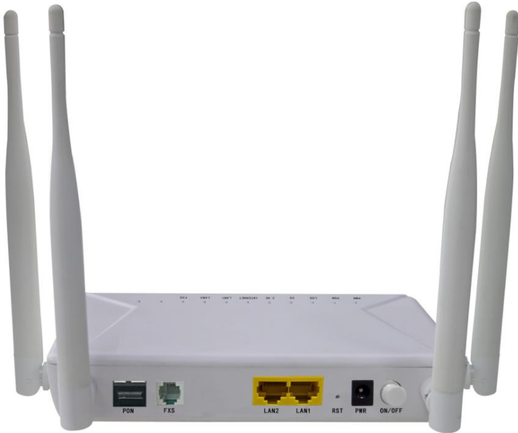
Picture 2-1 GL-E8021U-WF-D product figure